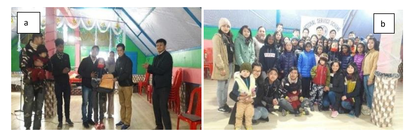
Pic-3 School bags being handed over to Children(a). Group photograph with the children (b) at Kiwanis Noora Children Home, Rangbull.