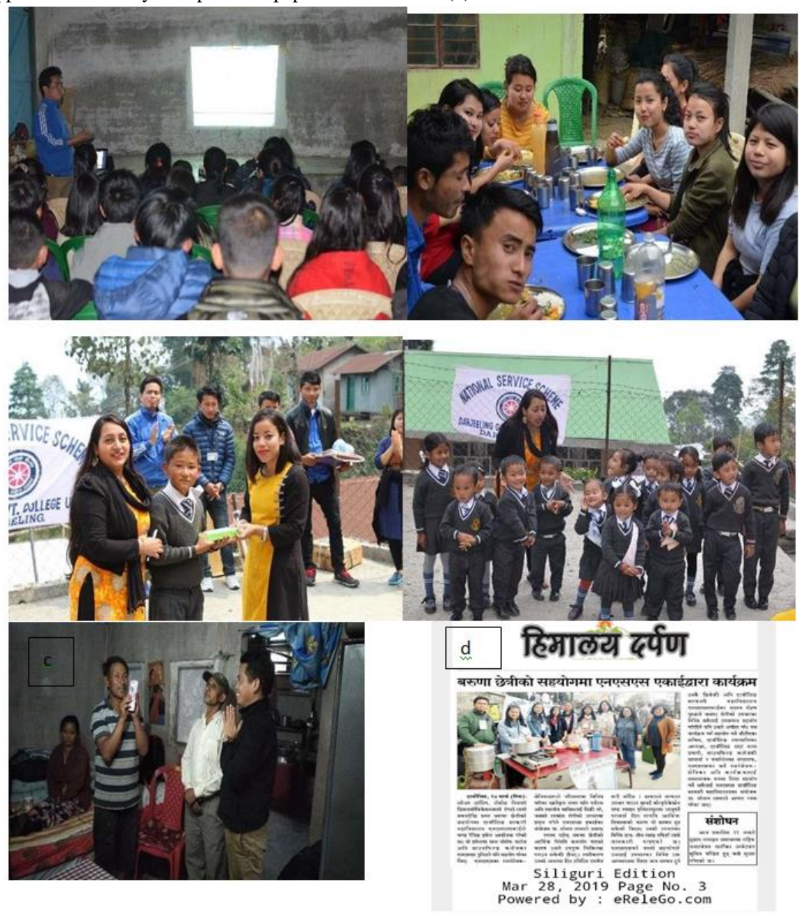
Pic-5 a-d. Glimpses of activites during Special Camp at Latpanchar (10<sup>th</sup>-12<sup>th</sup> March,2019).