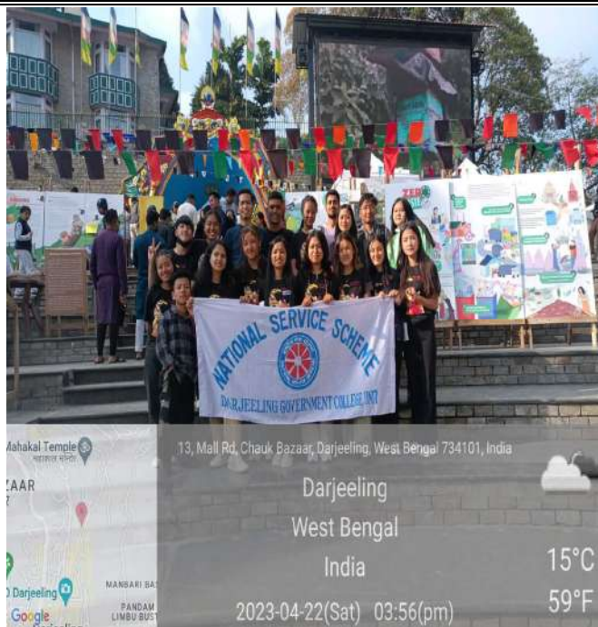
Pics 11. a-e- Volunteers during celebratory event of 25 years of project Serve, WWF at Darjeeling (21-23 rd April,2023)

Phone / Fax: (0354) 2254078 (0354) 2254019 Email : dgc.principal@gmail.com