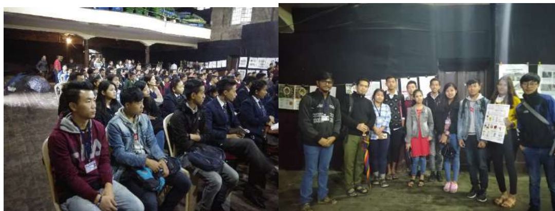
Pic-3 Volunteers and Program Officer at Capital Hall.