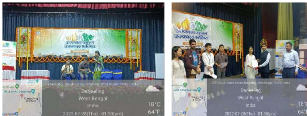
Pic.7 (a-b) Nukkad Natak, Ujjwal Bharat Ujjwal Bhavishya, Power@ 2047 on 28 th July, 2022