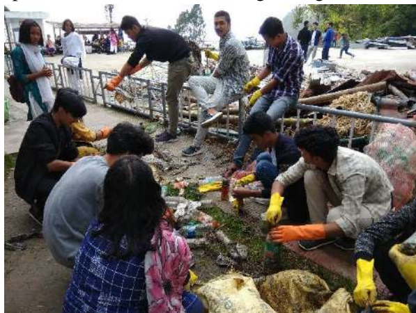
Pic-1 Volunteers making Eco-Bricks.

Making Eco bricks from the plastics collected for weeklong during 19th-24th August,2019 (Pic 1).