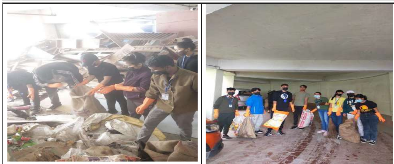
Pic 6 a-f- Glimpses of activities during Himalayan Cleanup on 27.05.2022.

Phone / Fax: (0354) 2254078 (0354) 2254019 Email : dgc.principal@gmail.com