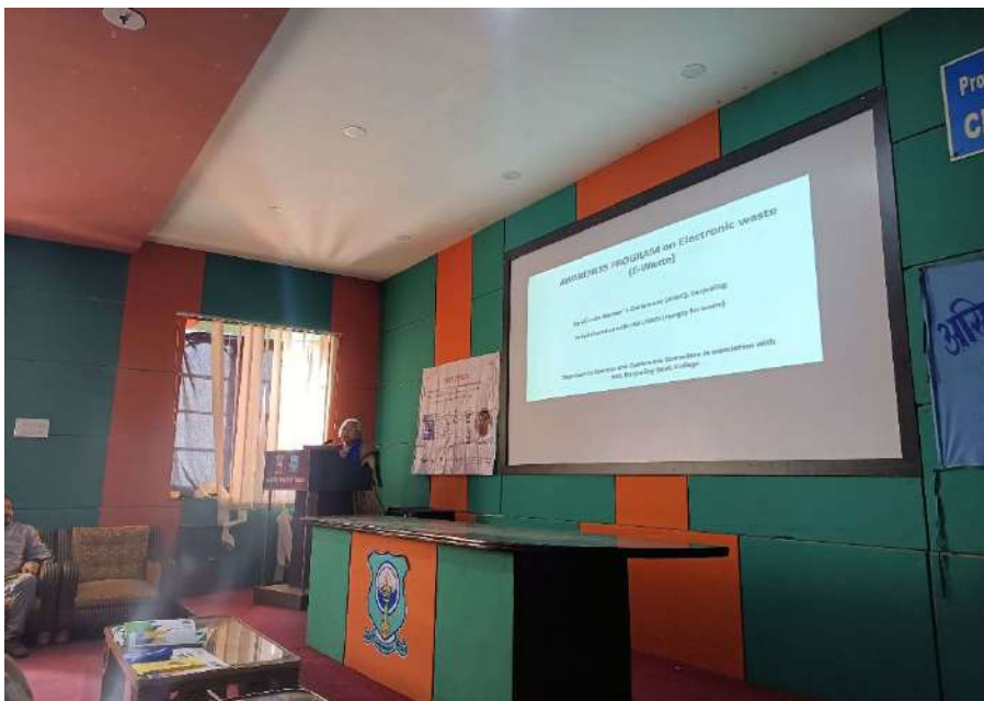
Pic 8 (a) Awareness Program on Electronic waste (E-Waste) on 18.11.2022.