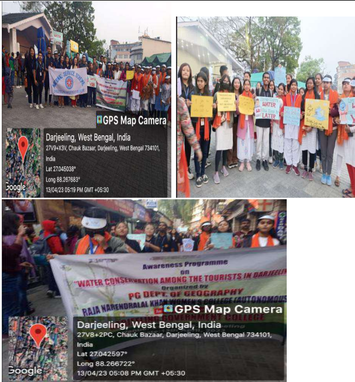
Pic 10. a-h- An awareness rally on Water scarcity and conservation among the tourist in and around Chowrasta with students from P.G. Raja NL Khan College, Midnapore on 13.04.2023

Phone / Fax: (0354) 2254078 (0354) 2254019 Email : dgc.principal@gmail.com